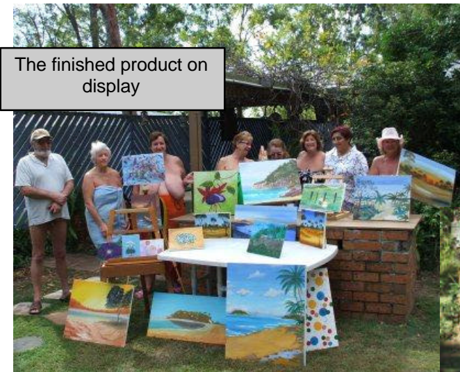
The finished product on display