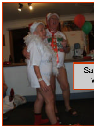
Santa will be pleased with our little act.

It was well worth the time to see all the performances - there were jokes told, songs sang, poetry recited, 'thingummies' made and a fabulous vaudeville performance.