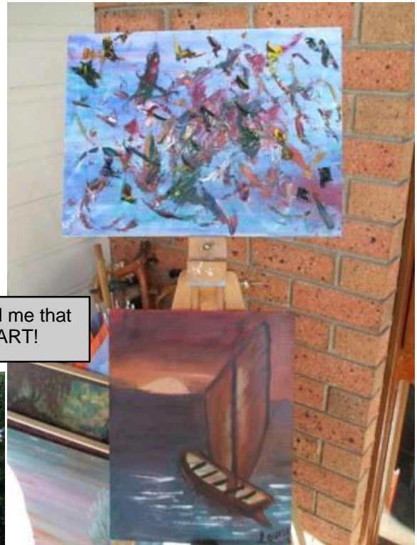
You cannot tell me that this is not ART!