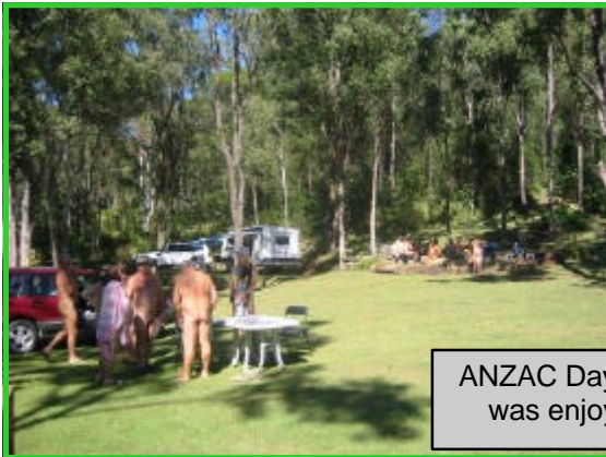
ANZAC Day sun which was enjoyed by all

Two-up was a feature with $6.00 being the total sum won from the game by Louise. All had an enjoyable but inexpensive time.