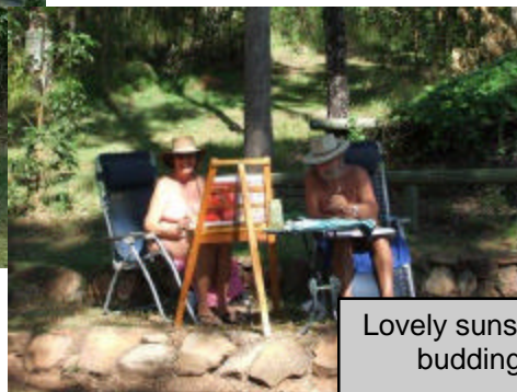
Lovely sunshine for the budding artists