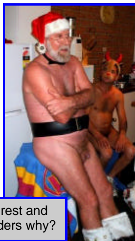
Santa has a rest and Rudolf wonders why?

Santa promised to be back next year. Shall we have another crowd waiting for him and his helper Rudolf?