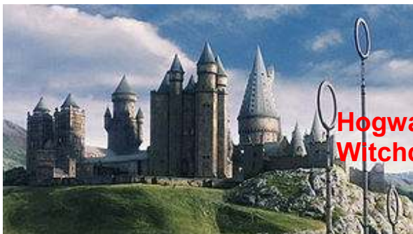
Hogwarts School of Witchcraft and Wizardry.