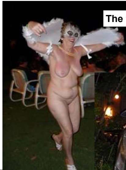
The friendly owl

Daylight 'happy hour' on New Year's Eve with people in 'uniform', soon changed to dressup (or is that really dressdown?) when night arrived.