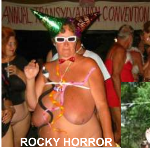
ROCKY HORROR SHOW