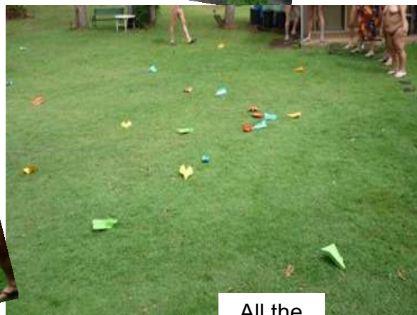
All the crashed 'planes!