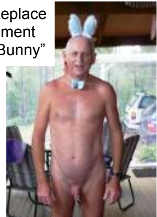
Replace ment "Bunny"