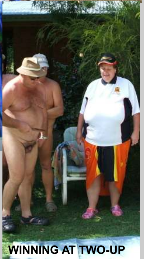
WINNING AT TWO-UP