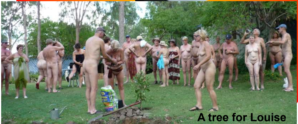
A tree for Louise