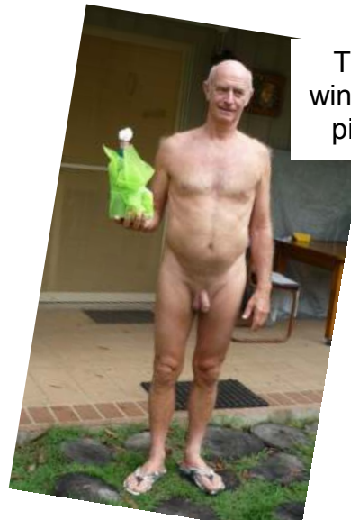
The winning pilot