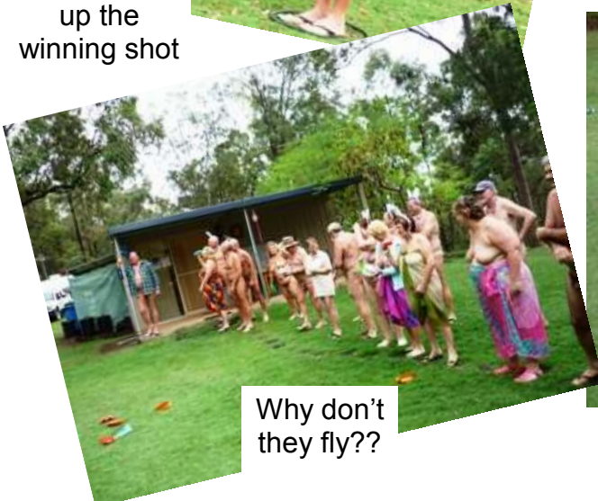
Why don't they fly??