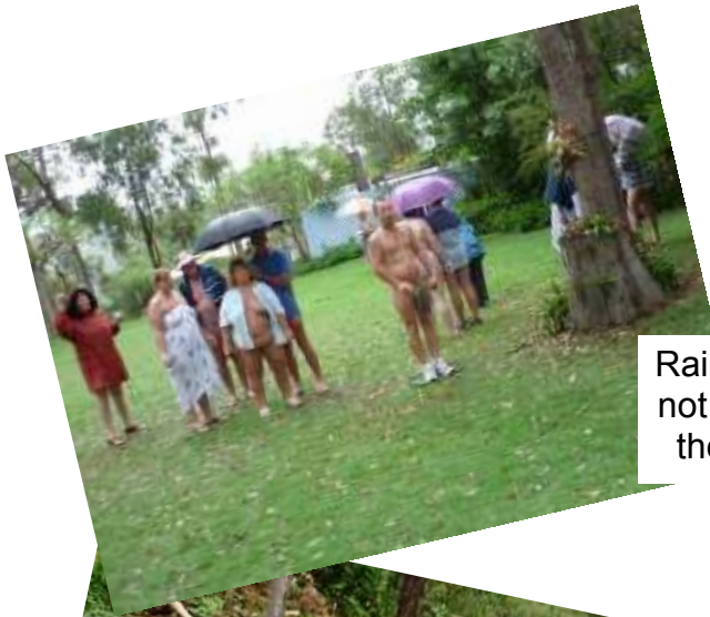
Rain will not stop them!

But the night time egg hunt went very well. Out of 80 eggs hidden by "Easter Bunny, 79 were found. Good going, all!